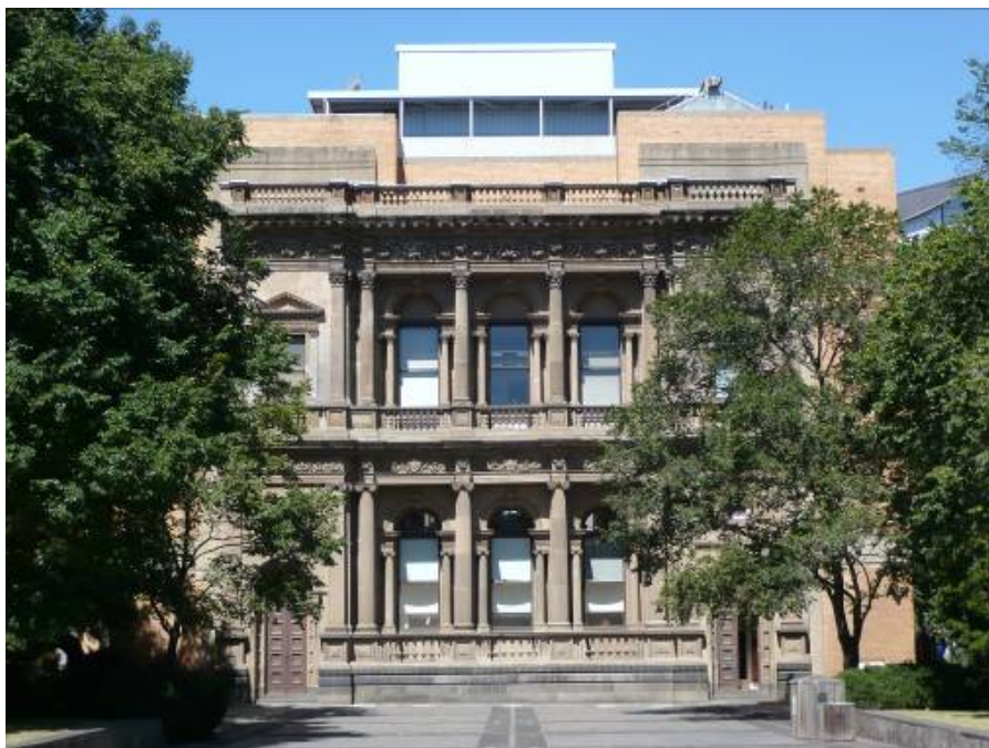
FIGURE 2: Western Façade of Old Commerce Building, featuring the bank façade designed by Joseph Reed (1856).

The current Parkville Campus Masterplan identifies the existing location of the Architecture and Old Commerce buildings as the site for the new building; development of this site will be undertaken in accordance with the Masterplan. These current buildings contain items of heritage significance including murals, stained glass windows, sculptures and statues. Notable among these, the former is home to the Japanese Room, a space fitted out by appreciative alumni from Japan using traditional Japanese finishes and fittings, and a Japanese Garden. The Old Commerce Building currently includes on its west façade historically significant elements from the former Bank of New South Wales building in Collins Street, Melbourne, by the architect Joseph Reed of Reed and Barnes. This façade was originally built in 1856 and was transplanted to the Parkville campus in 1936. These elements will need to be addressed in the design response in accordance with University heritage management plans and policies.